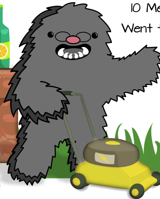
10 Men Went to Mow, Went to Mow a Meadow