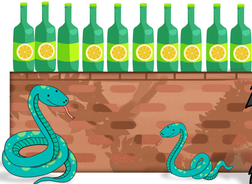
Ten Green Bottles Hanging on a Wall